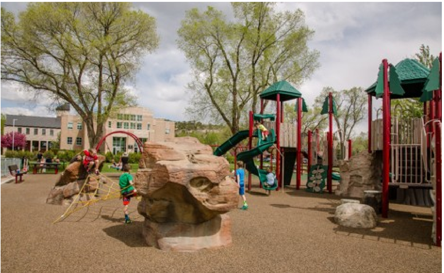
Eagle Town Park 2018

Mountain Recreation also manages league sports, fitness classes, the Eagle County Fairgrounds Sports Complex, Gypsum Recreation Center, and Edwards Field House. For full facility and activity listings visit https://mountainrec.org/ .