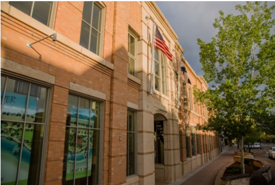
Town Hall is located at 200 Broadway at the corner of Broadway and Second Street. Office Hours are Monday – Friday 8 am to 5 pm and we are closed on holidays.

Town of Eagle is one of western Colorado's best kept secrets – a hidden gem with pristine and abundant access to epic and nearly untouched mountain biking, trail running and hiking, year-round events and Gold Medal fly fishing. Surrounded by BLM, state parks and open space lands, we invite you to Discover New Terrain.