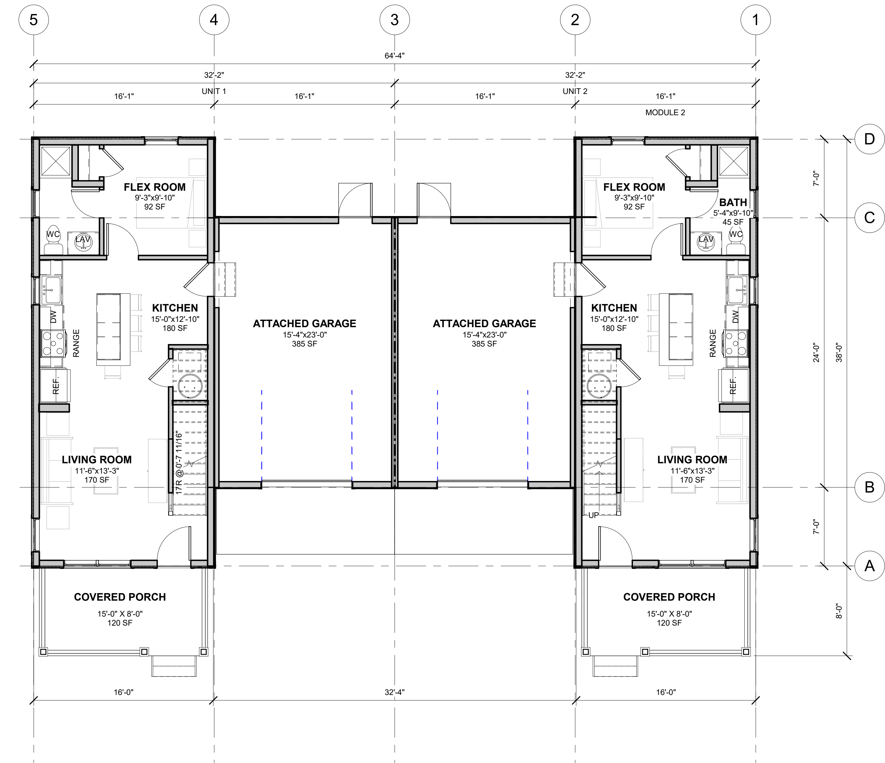
1 FLOOR PLAN - LEVEL 1 (SHAVANO) (2) 608 SQ FT 3/16" = 1'-0"