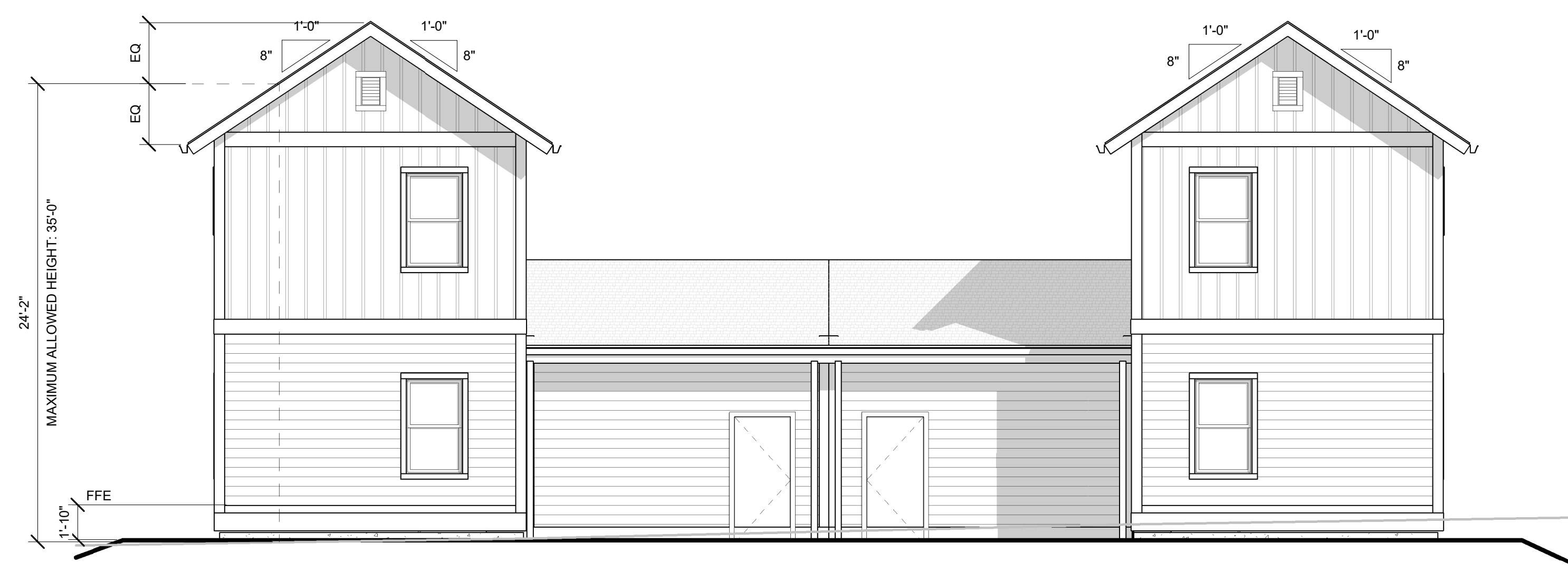
2 REAR ELEVATION 3/16" = 1'-0"