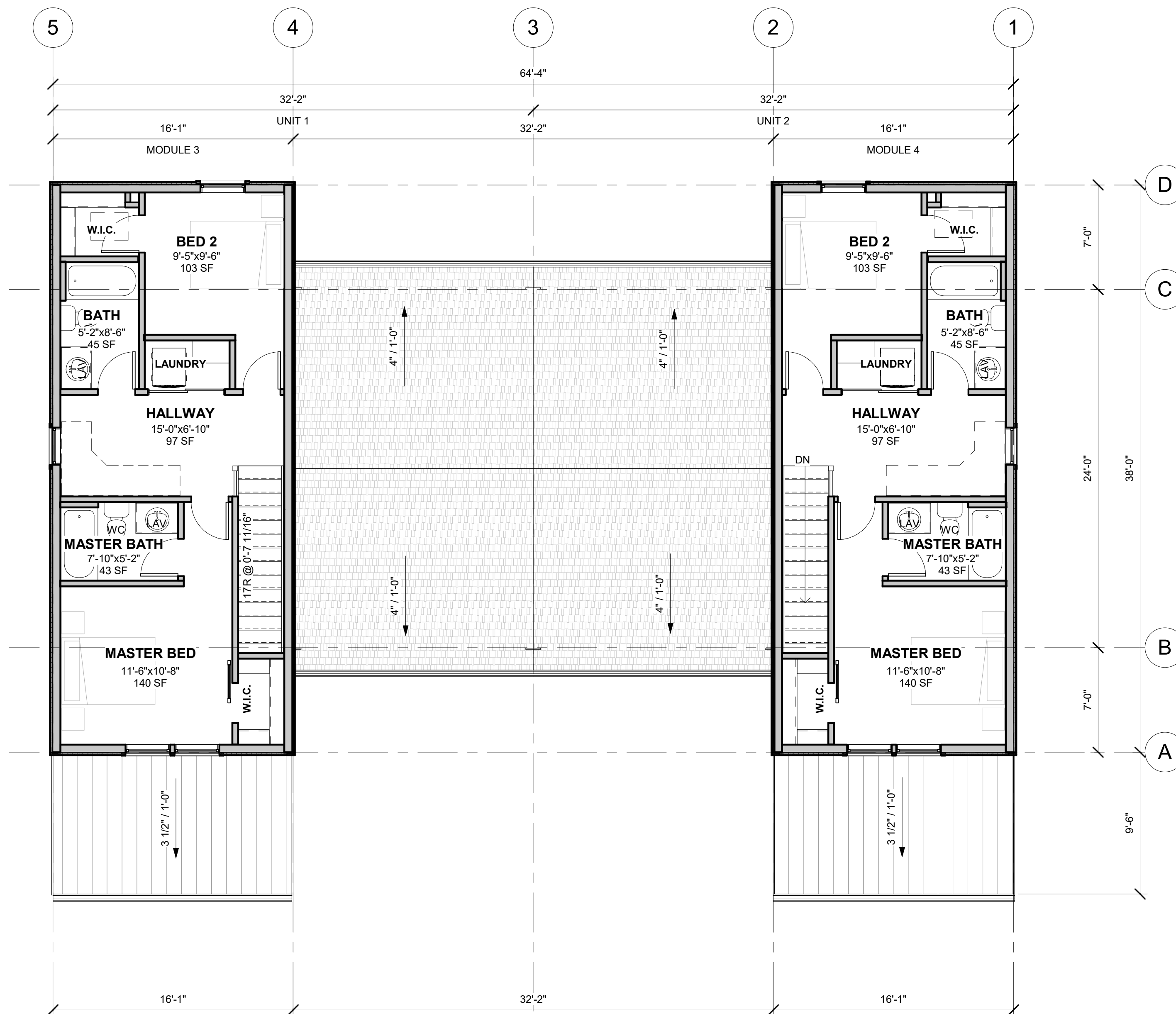
2 FLOOR PLAN - LEVEL 2 (SHAVANO) (2) 608 SQ FT 3/16" = 1'-0"